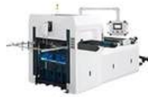
Die cutting machine