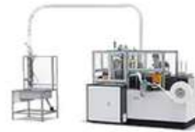
Paper Cup Machine